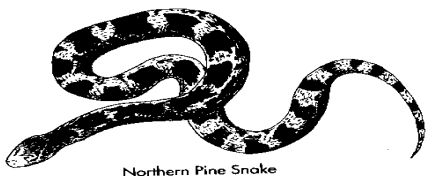
Northern Pine Snake

sion of Colonial Drive is the second access route.