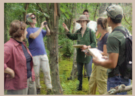
Wharton State Forest Pond Survey Training