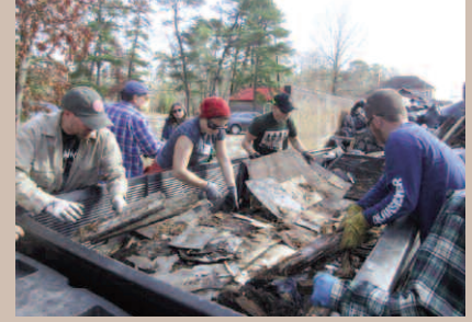
Historic Whitesbog Village