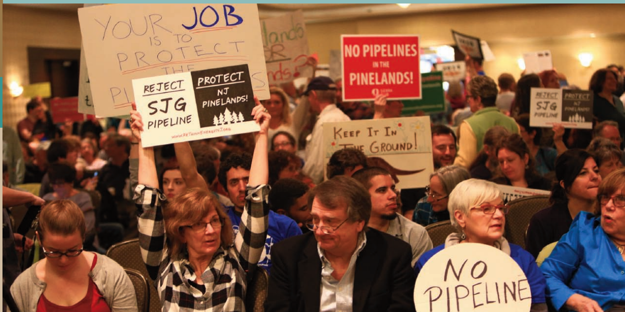
Residents protest the South Jersey Gas Pipeline during the Pinelands Commission vote on February 24th.