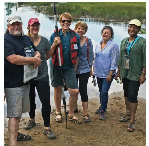
Staff from the G. R. Dodge Foundation enjoy a day in the Pinelands with Pinelands Adventures.

Spring Guided Trips are listed on page 7 of this newsletter.