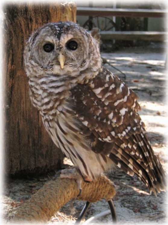
Barred Owl at Woodford Cedar Run Wildlife Refuge

Bald Eagle Haliaeetus leucocephalus Barred Owl Strix varia Great Horned Owl Bubo virginianus Osprey Pandion haliaetus Red-tailed Hawk Buteo jamaicensis Red-Shouldered Hawk Buteo lineatus Screech Owl Otus asio