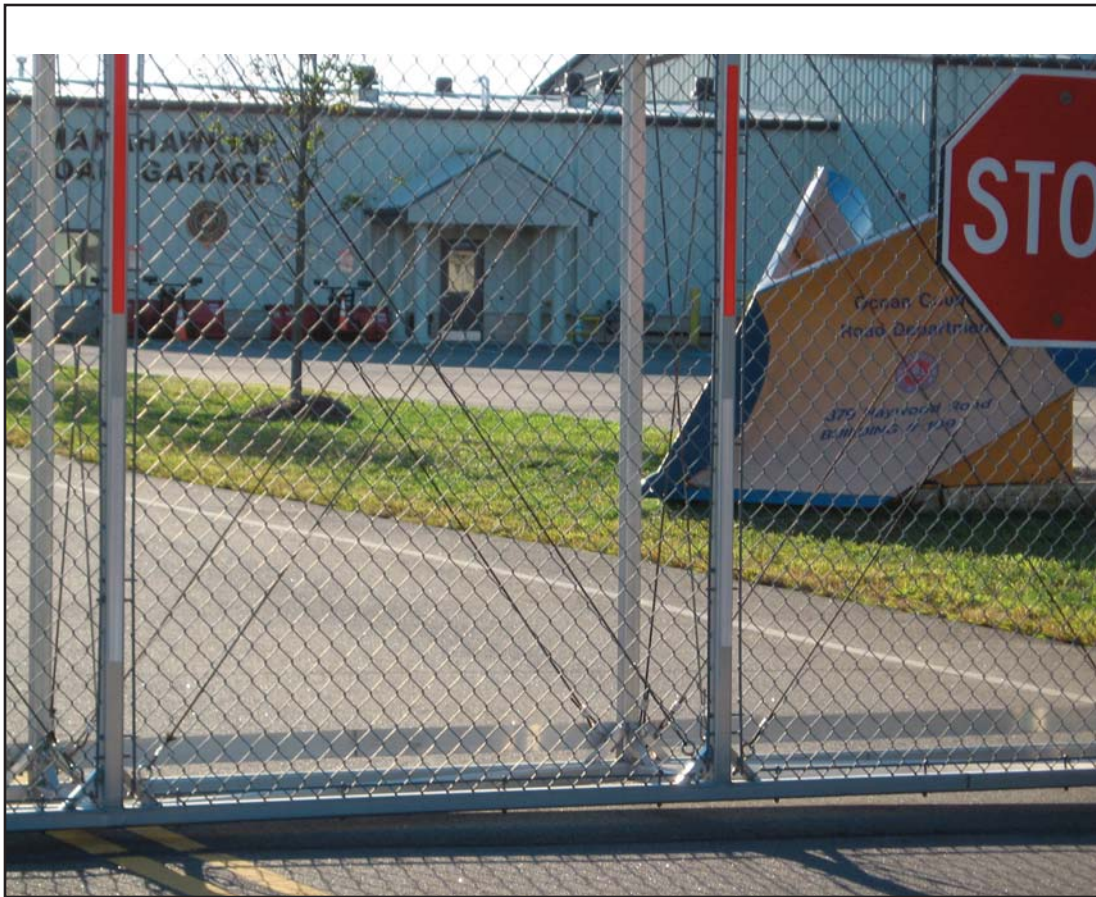
Gated entrance to the Ocean County Road Department and Recycling Facility area. This gate is before the scale house.