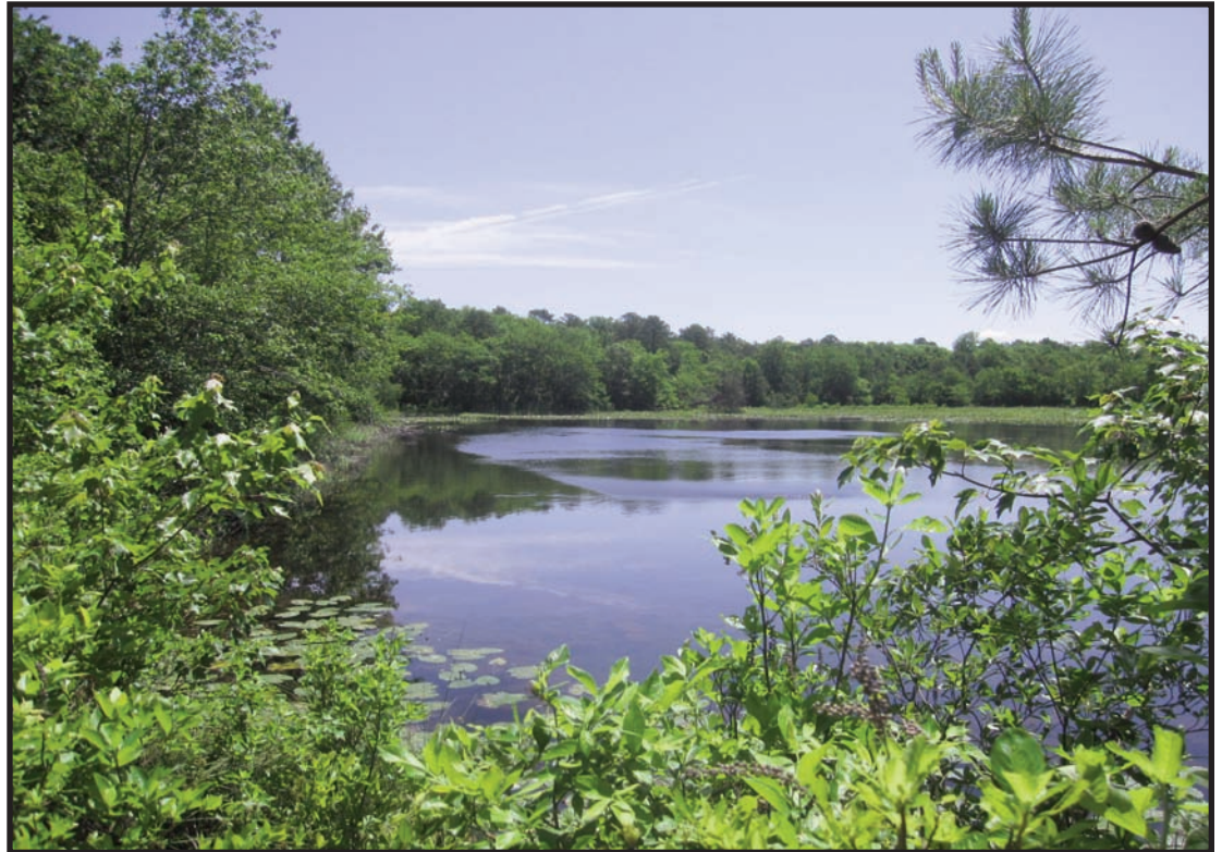
The Black Run Preserve in Evesham Township, Burlington County