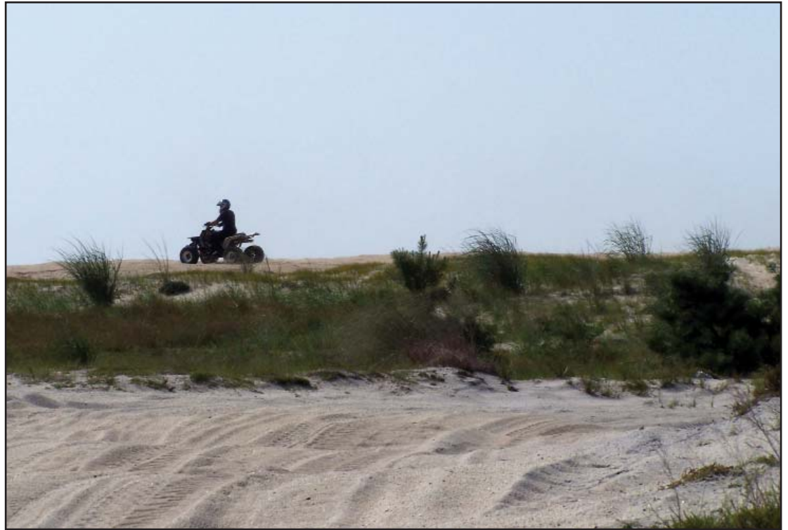
ORV use on private property in Ocean County