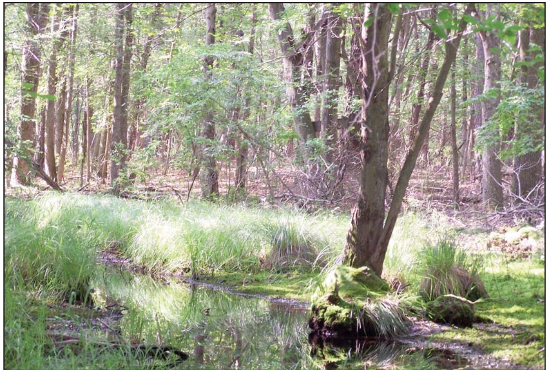
Land such as this in Ocean County needs funding to be purchased