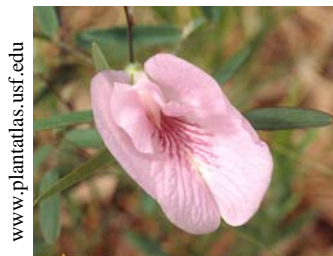
Butterfly-pea, a very rare Pine Barrens up-land plant,

Pinelands Commission Science Activities: The Commission has released its Draft Work Plan for how state and federal agencies will conduct a $5.5 million study of the shallow Kirkwood-