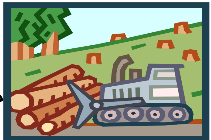
It IS possible to get involved BEFORE things look like this!