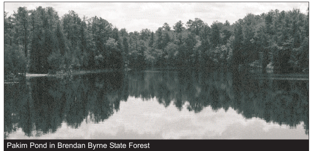
Pakim Pond in Brendan Byrne State Forest