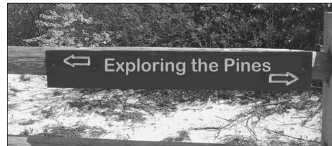
This is a great time to explore the Pines