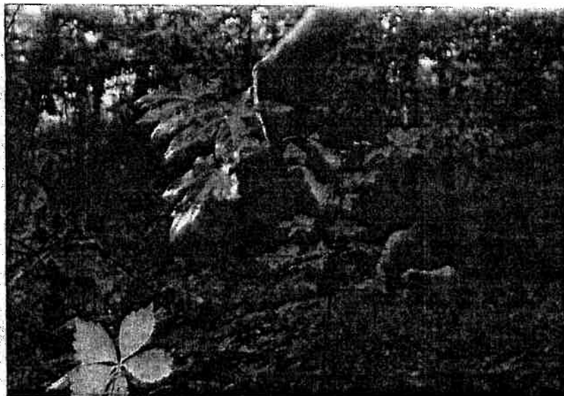
Rich Eggert of Plumsted points to a young maple tree growing on a site where the Plumsted MUA wants to build a sewage treatment center.