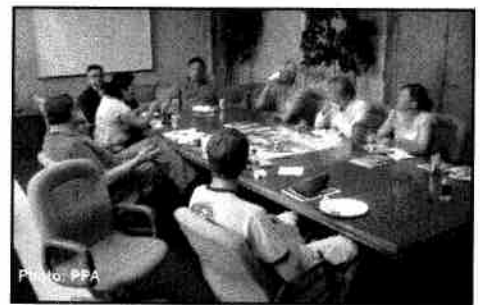
PPA staff get a Meadowlands overview

PPA staffers spent a beautiful May day in the Meadowlands, where NJ Meadowlands Commission staff graciously treated us to a tour of their offices and an excellent overview of the regulations governing the Meadowlands and the challenges of promoting environmental protection in such a severely impacted landscape. Some highlights of our visit below.