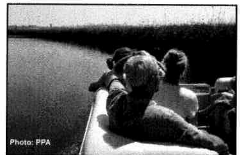
An up close view of the marshland