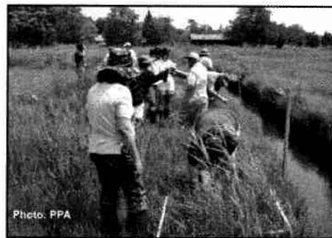
Sampling quadrats along salt marsh transect at the Lighthouse Camp in Waretown