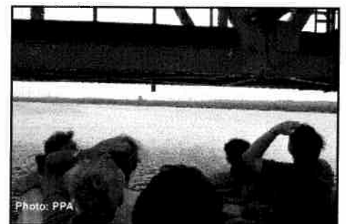
Cruising under a railroad drawbridge