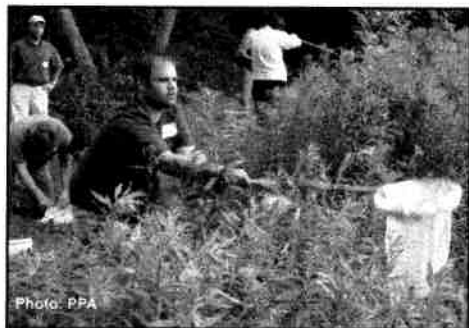
Sampling grassland at Bishop Farmstead