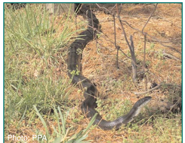
Several Black Rat Snakes have been observed at the Farmstead this summer