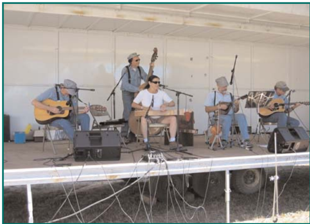
The Sugar Sand Ramblers playing at last year's Pinelands Discovery Festival

Each year October is proclaimed as Pinelands Month in the state of New Jersey. This year the Pinelands Preservation Alliance is celebrating the 11th year of hosting the gateway event to begin the fall festival season in the Pinelands. The festival encourages a day of discovery and environmental awareness, while providing a microcosm of the Pinelands experience. Held at Historic Whitesbog Village in Browns Mills, Burlington County, on Sunday, October 1, the event runs from 11am to 4pm. A parking fee of $5.00 per vehicle will be charged. All events at the festival are free.