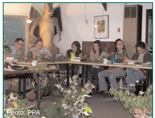
Students at PPA's Special Pinelands Plants Course are meeting seasonally at the Farmstead through the Fall