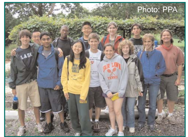
A class from the NJ Governor's School on the Environment met at the Farmstead in July for an overview of the Pinelands before embarking on a PPA-led field trip