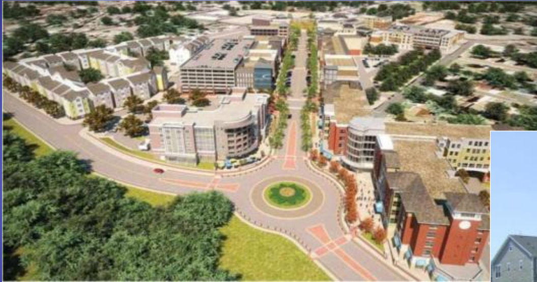
Glassboro College & Downtown Linkage