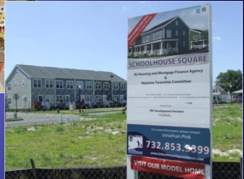
Neptune Affordable Housing