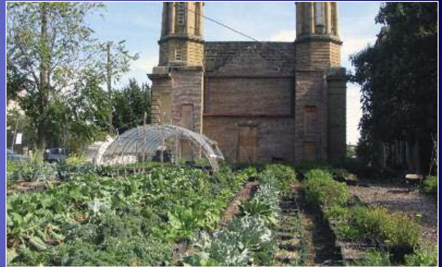
Newark Sustainable Development