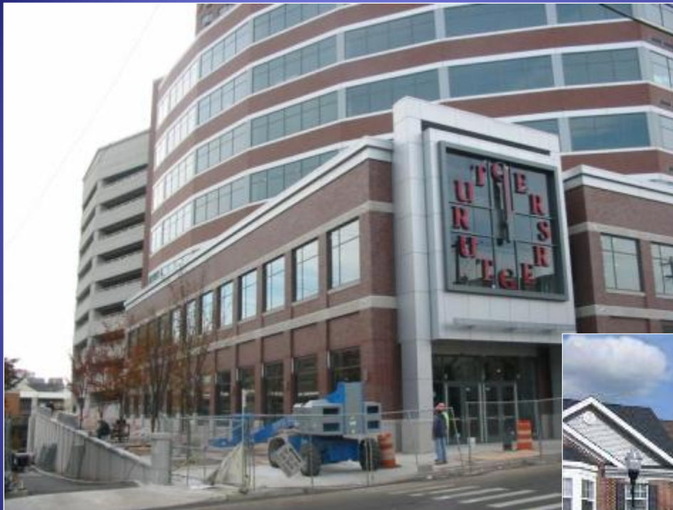
New Brunswick Transit Oriented Development