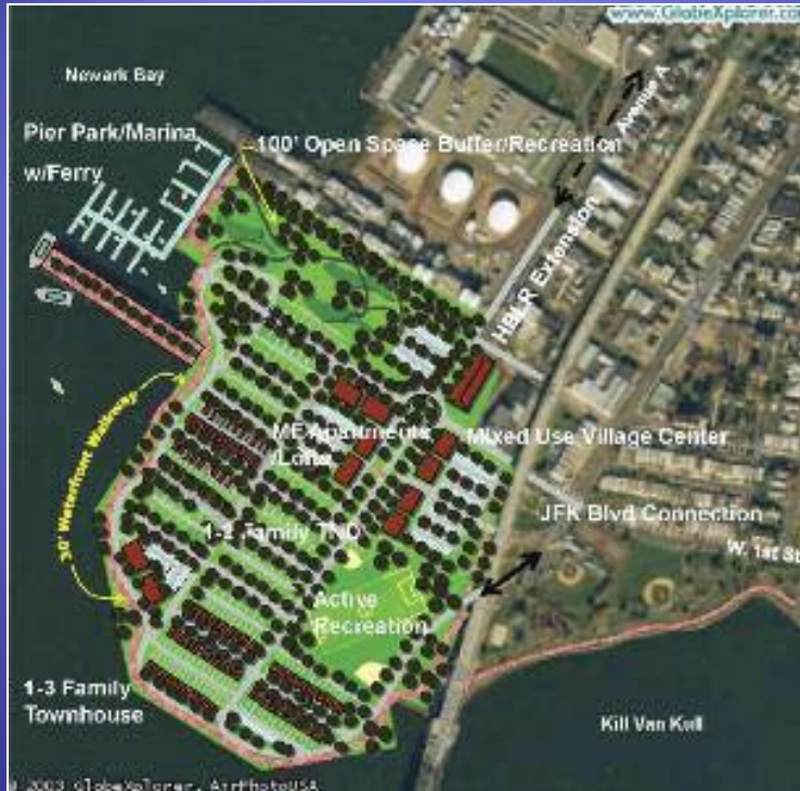
Bayonne New Mixed Use Neighborhood