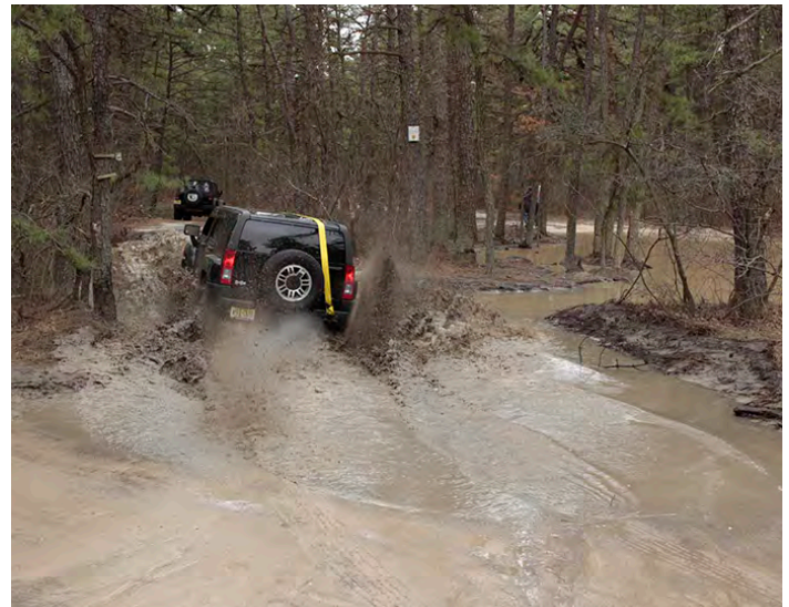
Wharton State Forest, High Crossing Road: Over the years roads like this have been greatly enlarged by 4x4s driving through large puddles and making pathways around them.

Vocal criticism followed the release of the DEP's plan for Wharton – especially from users who don't want their access to any part of the state forest restricted. Now we fear the DEP has stepped too far back from the original purpose of this plan.