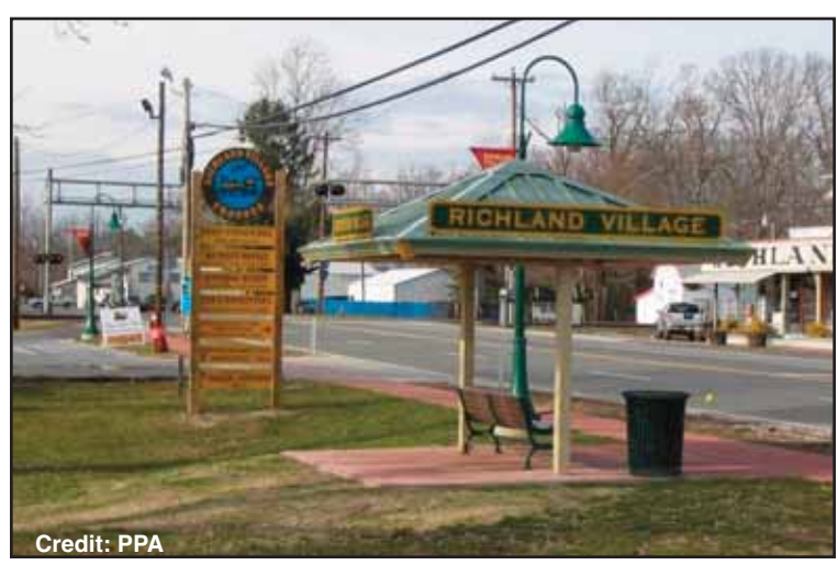
Richland Village in Buena Vista

Buena Vista Township, described by one Pinelands Commissioner as a rogue municipality, disregarded the Pinelands CMP by racking up another CMP violation in the