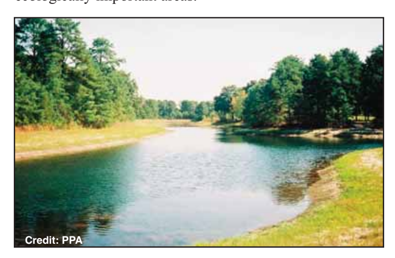
Lake in Pemberton Twp. vanishing because of groundwater pumping

Still waiting! This important project is now <u>four</u> years overdue, and the completion date is still uncertain. In 2001, the New Jersey Legislature directed the Commission to prepare an assessment of the key hydrologic and ecological information needed to determine how the current and future water-supply needs within the Pinelands may be met while protecting the shallow Kirkwood-Cohansey aquifer system. The ultimate purpose of this $5.5 million study is to develop the necessary information to avoid ecological impacts to streams and wetlands from water supply wells drying up ecologically important areas.